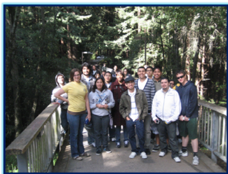
UC Santa Cruz Tour Spring 2011

This activity helps students visualize and experience their potential transfer campuses. Through this experience students gain a better understanding of the campus atmosphere throughout each